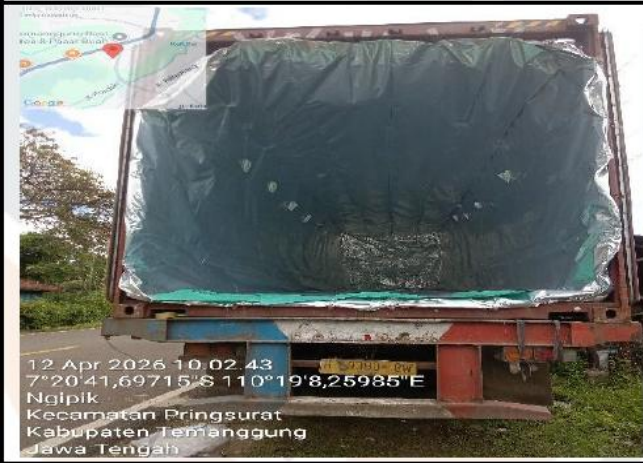
VIEW OF INNER STRUCTURES OF CONTAINER