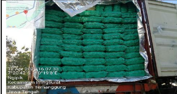
VIEW OF FULL CARGO LOADED BEFORE THERMAL CLOSURE ON CONTAINER