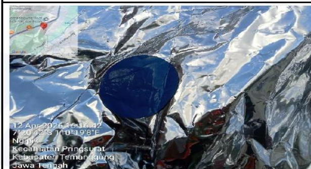
VALVE INSTALLED PROPERLY