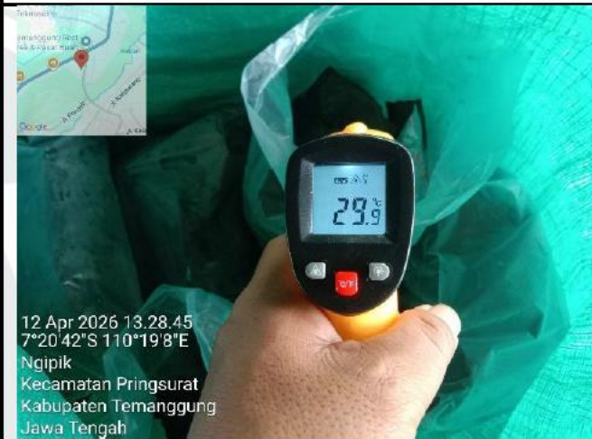
VIEW OF CARGO TEMPERATURE