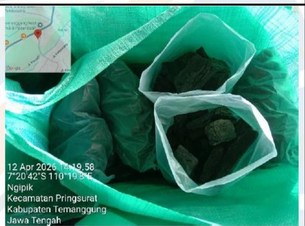
VIEW OF CARGO IN PACK