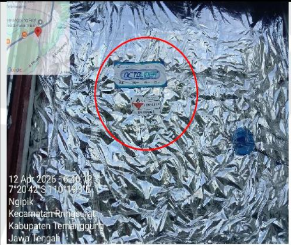
VIEW OF OVERPACK STICKER