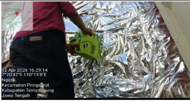
VIEW OF VACUUM PROCESS